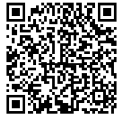
Meals on Wheels

Make an appointment by online inquiry or through telephone intake.