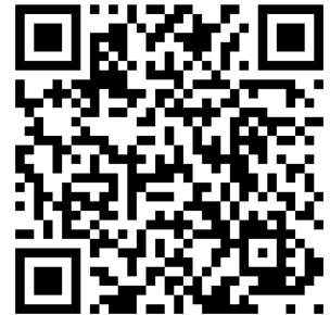
Guelph Food Bank

Office Hours: Monday to Friday 9:00 a.m. - 4:00 p.m.