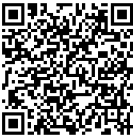
Canada Post MyMoney Account

The Canada Post MyMoney Account aims to break down financial barriers by providing accessible, low-cost, and feature-rich banking solutions through a safe, trusted and widely available network.