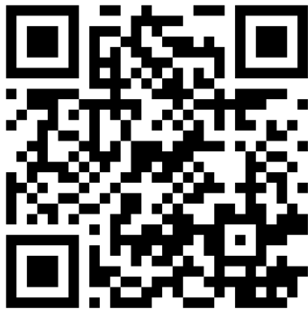
Out on the Shelf